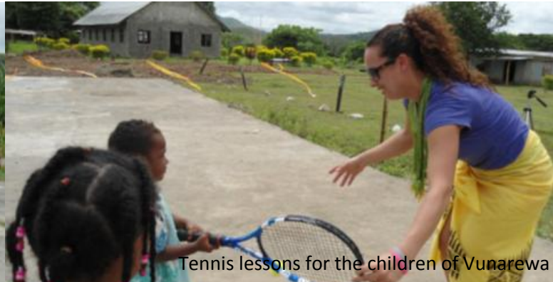
Tennis lessons for the children of Vunarewa