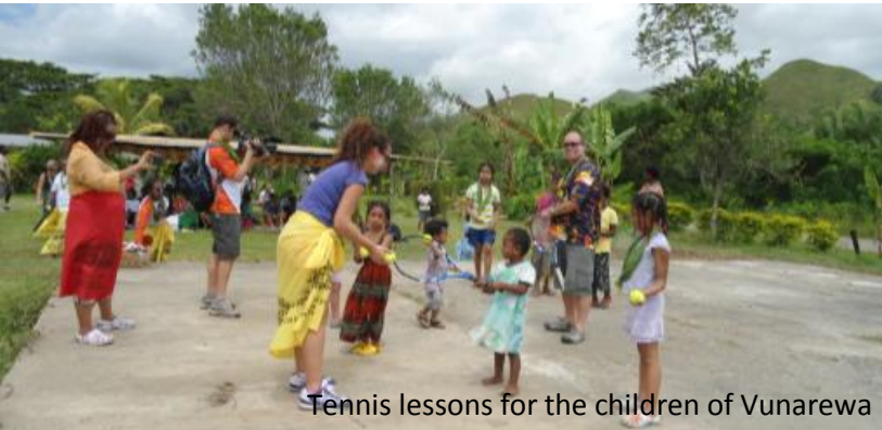
Tennis lessons for the children of Vunarewa