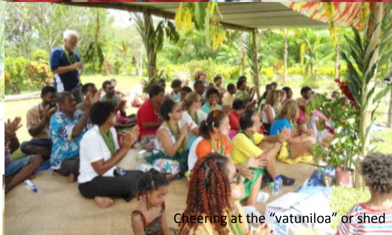
Cheering at the "vatuniloa" or shed