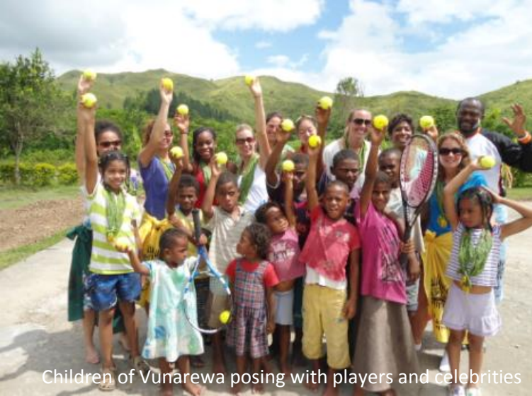
Children of Vunarewa posing with players and celebrities