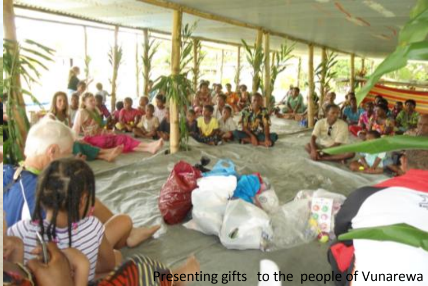
Presenting gifts to the people of Vunarewa

The children and people of Vunarewa village in the heart of the Sigatoka Valley were filled with much joy and happiness when their village was presented with gifts from the tennis players and Hollywood celebrities who were in Fiji for the annual Fiji Tennis Invitational Classic.