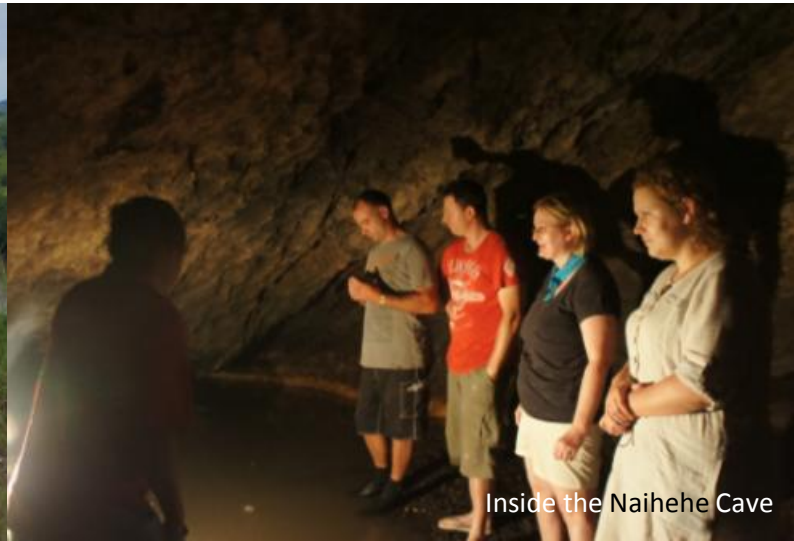
Inside the Naihehe Cave