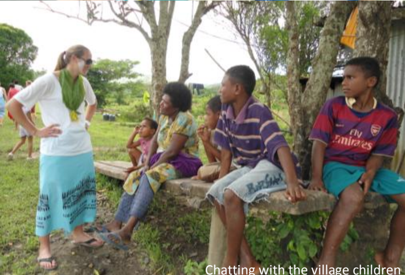
Chatting with the village children