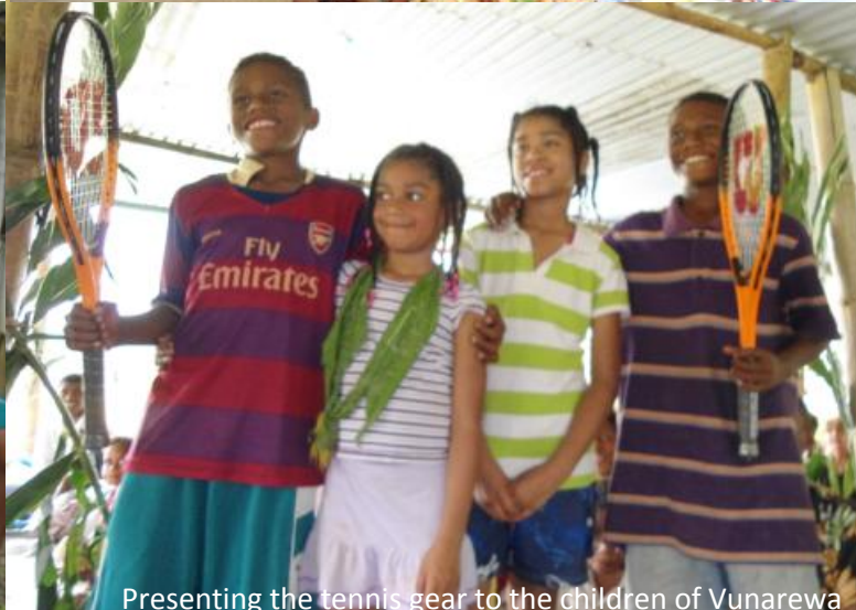
Presenting the tennis gear to the children of Vunarewa