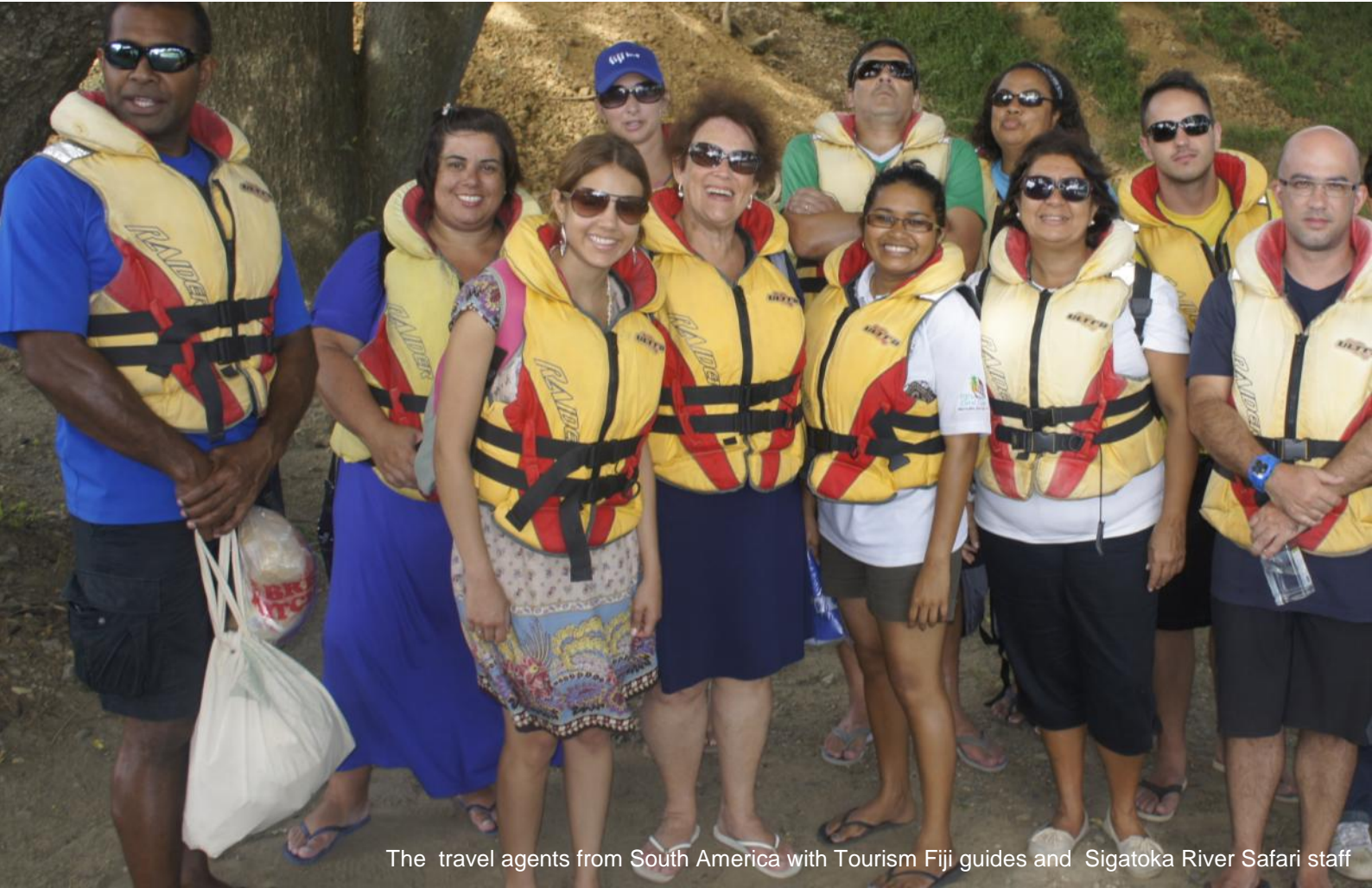
The travel agents from South America with Tourism Fiji guides and Sigatoka River Safari staff

A group of 8 travel agents from Brazil recently experienced Sigatoka River Safari as part of their familiarization programme to Fiji with one in particular wowing the villagers of Vunarewa with his dancing skills.