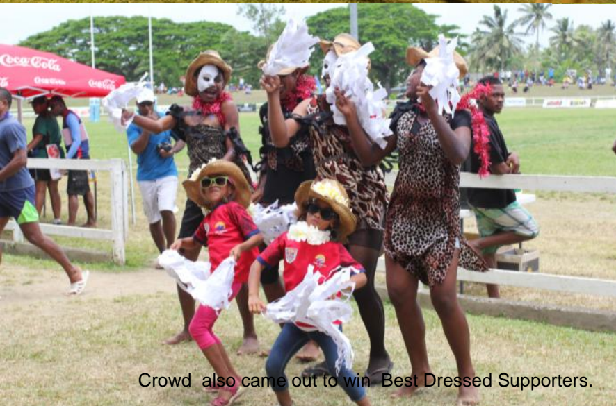
Crowd also came out to win Best Dressed Supporters.