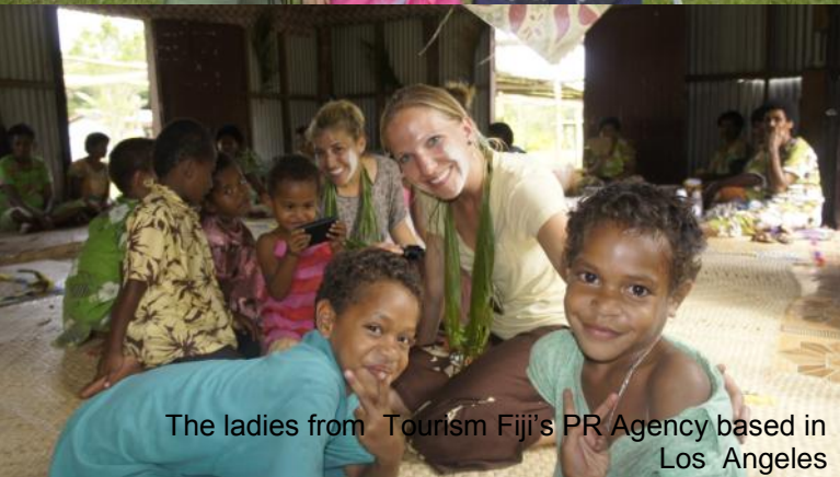
The ladies from Tourism Fiji's PR Agency based in Los Angeles