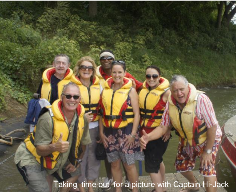
Taking time out for a picture with Captain Hi-Jack

Several top media Editors and journalists from New Zealand took time out of their busy schedule to visit Fiji and were on board safari on the 16th of November.