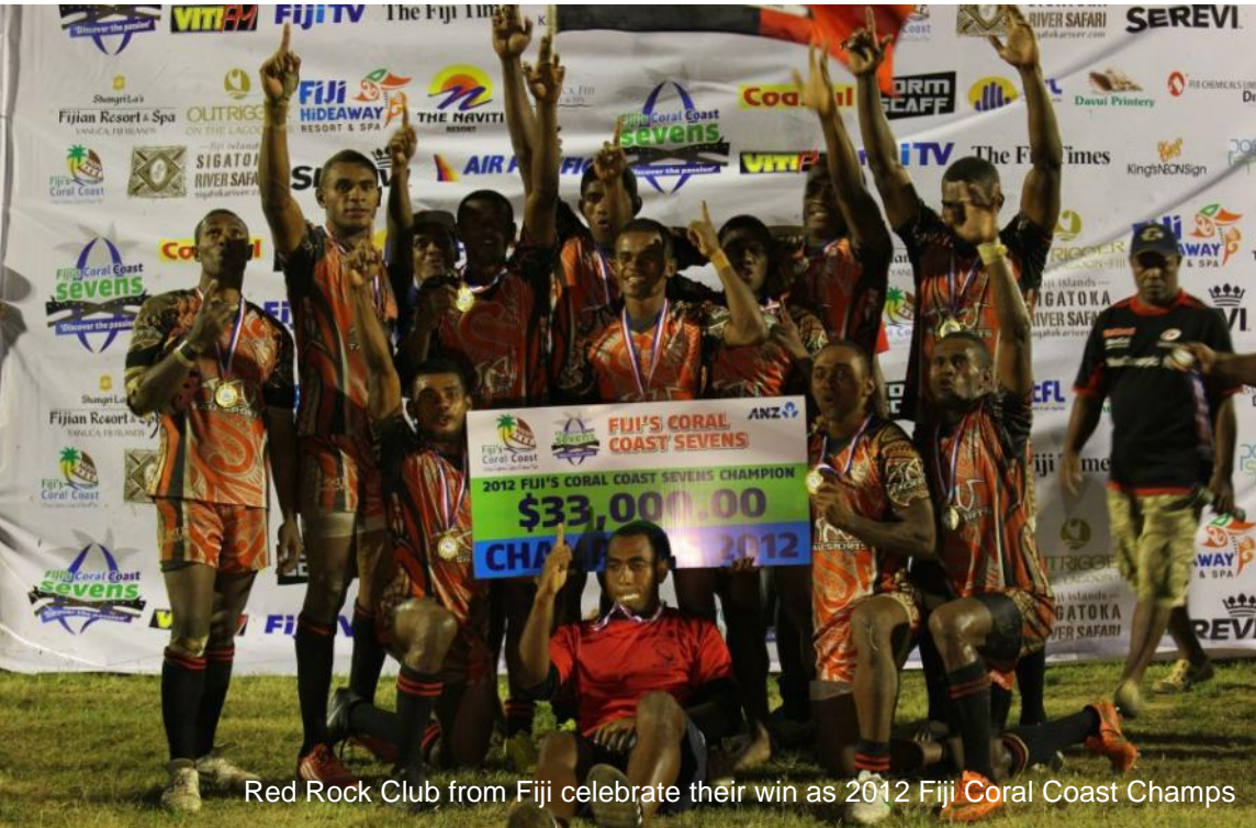
Red Rock Club from Fiji celebrate their win as 2012 Fiji Coral Coast Champs

S igmatoka River Safari a sponsor of the Coral Coast 7s also